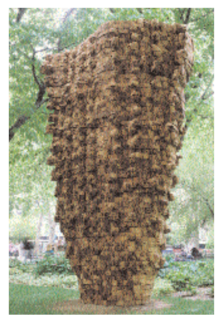
Left: berwici pici pa, 2004. Cedar and graphite, 1,040 x 96 x 65 in. Above: Czara z babelkami, 2006. Cedar, 202 x 125 x 74 in.

I know they're reliefs, but, to me, they're mainly drawings that I first did with chalk, then pencil, and finally cut with a circular saw in such a way that I either disrupted or amplified what was there to jar those drawings and give them greater depth.