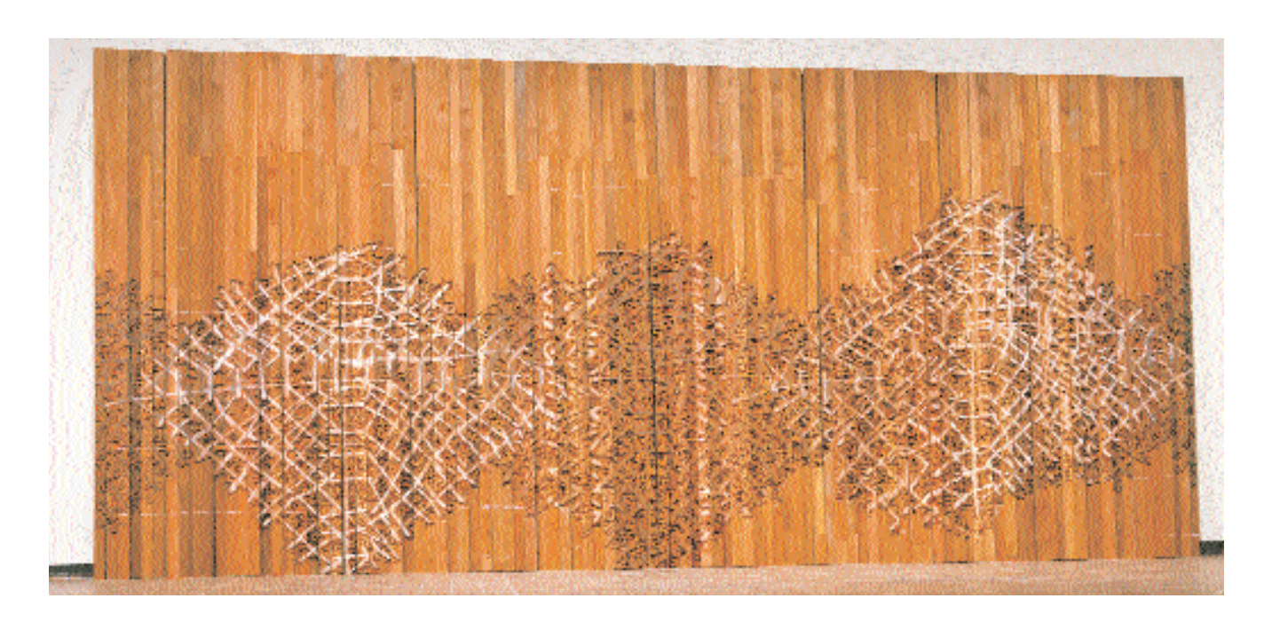
Above: Mama, build me a fence , 2001–02. Cedar, graphite, and chalk, 168 x 367 x 17 in. Right: Damski Czepek , 2006. Polyurethane resin, 143 x 406 x 364 in.

neck or waist of a sweater. Czara z babelkami stands very slender at one side of her profile and gets outrageously wide-looking at her head-on side. She's 11 feet wide at the top and 17 feet high. I started with a grid, the grid of the unbleached wool sweater made with popcorn stitches that I wore as a child. That grid got stretched and worn. It was one of my only pieces of lovely clothing. In time, the babelki lost much of their grid and wandered, making larger spaces between themselves around the shoulders and the belly. I had fun making babelki into large cedar structures. I made portions of the cedar grid in a slow and deliberate way (as seemed respectful to this scale) to make room for something like a belly.