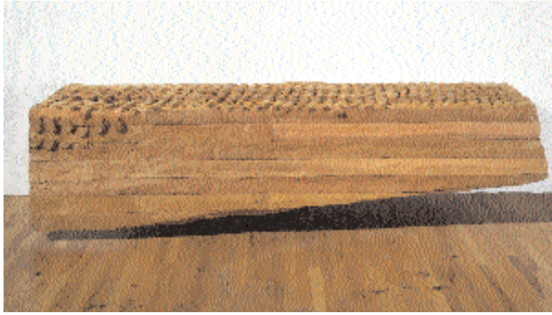
Left: Large Ring, 2005-06. Cedar, 71 x 65 x 5 in. Above: Spreading Blue, 2006. Cedar and graphite, 26 x 103 x 28 in.

could be some sort of regulated landscape that took a turn and fell—a rank and file formation of dots that turns erratic, with some dots falling off, a kind of slow wandering away.